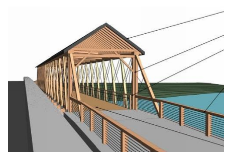
Diagram of reconstructed Bell Ford Covered Bridge