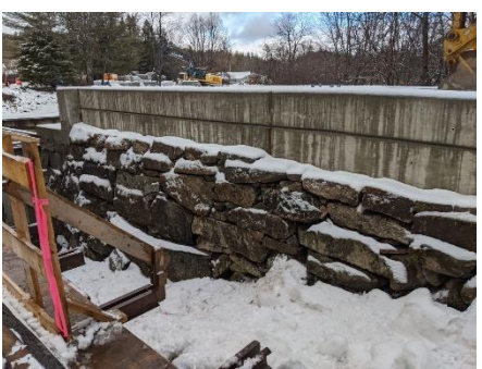
New southern abutment.