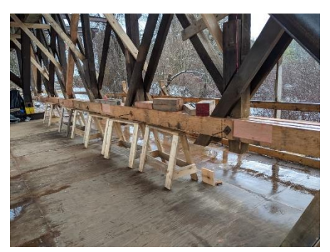
New lower chord in place.