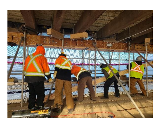
Crew lifting a new floor beam.

With the cold weather in the winter, and the humid summers, parts of the bridge began to deteriorate. Over time, the bridge has had patch repairs, but even then, the bridge has started to sag.