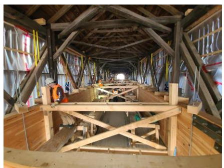
Large timber beams were inserted to support the bridge during repairs. They were also used to reinstate camber back into the structure.

and also surplus capacity to fight some of the stiffness of the truss, as well as additional load for the scaffolding, the equipment, and the Timber Restoration Services crew.