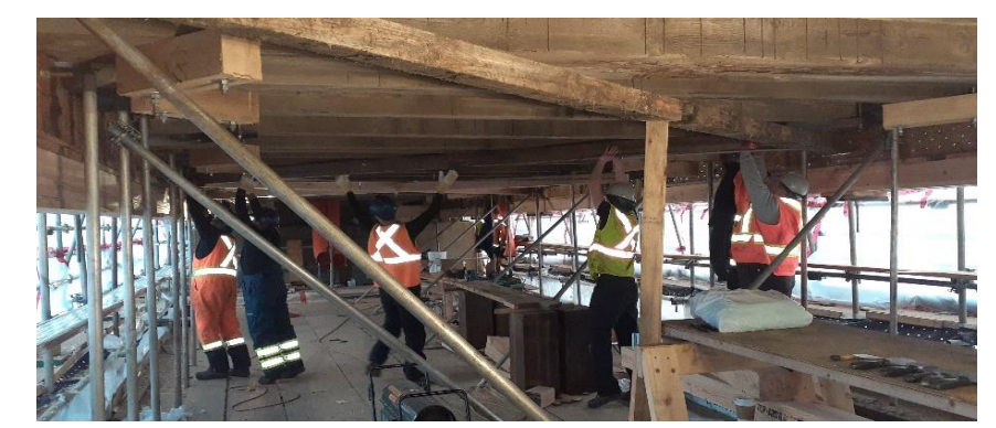
Setting a new floor beam in place.

restoration of the tension tie, or a "hard fix", which means the reinforcement will be fully engaged with dead and live loads. With this design, utilizing the lifting beams, replacing the hanger rods, and providing clamping force, a camber can actually be reinstated in the bridge. Over the years, as the bridge sagged, some of the truss connections were loose. With the reinstatement of camber, the gaps close - reengaging the connections.