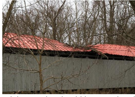
services impacted by COVID-19. Funding has again been secured and the repairs should be completed during the 2021 construction season.

was evaluated and the truss structure was not impacted. The roof systems sustained all the damage. Drawings and specifications for the repair are in place and funding was in place. The repair was planned for last summer, but funds needed to be diverted to essential