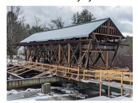
Temporarily relocated bridge.

Previous issues have described the work occurring at this bridge. Since our last update, the southern abutment has been rebuilt at its new height. The abutment is made of concrete that has been faced with the stones from the former abutment. It appears that the concrete work on the northern abutment is complete. That one will be faced with new granite blocks. The lower chords and a small number of truss timbers have been replaced while some others have had deteriorated sections cut out and new wood spliced in. Work stopped for the winter and will pick up again about the time you receive this issue.