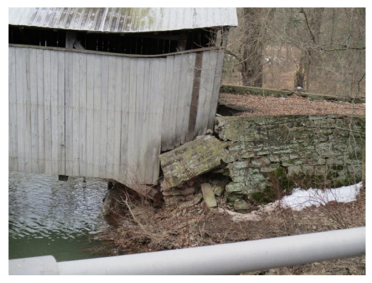
Go Fund Me Page