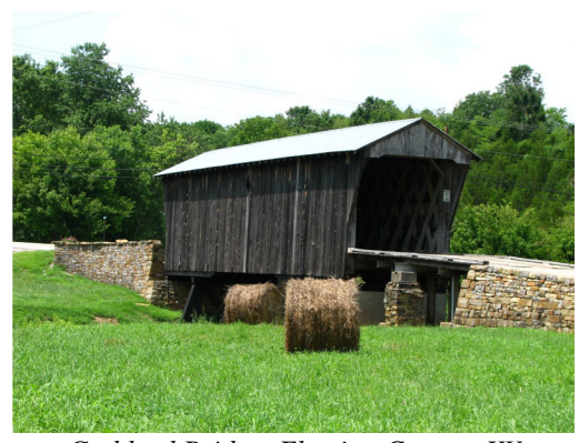
Goddard Bridge, Fleming County, KY

Raising awareness of the bridges will not only encourage tourism in those areas, but raise awareness of the need to maintain them. Kentucky has spent millions of dollars restoring the bridges one-by-one. The Beech Fork Bridge in Washington County is presently being restored. The recent restorations at