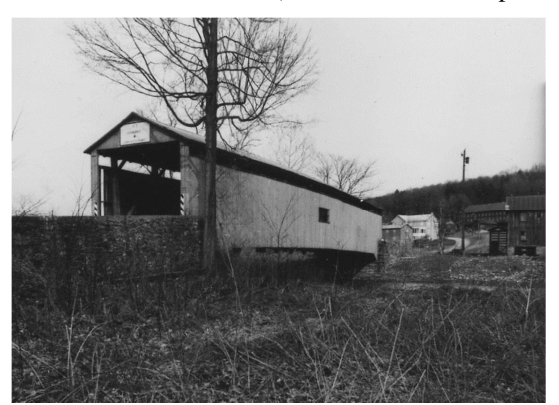
A. Schwab Photo, NSPCB Archives, April 9, 1965