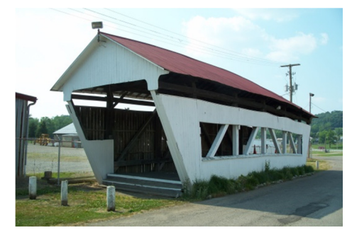
(Photos by Janis Ford, Right Photo Taken May 2012) (Lancaster Eagle Gazette, May 2, 2016)