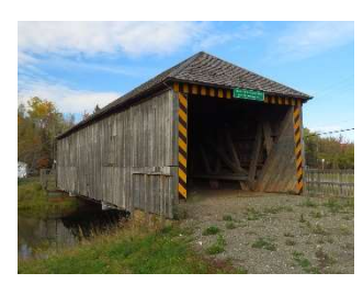
Peter Jonah Bridge